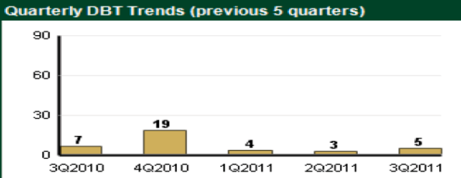
Payment Trends Analysis Account Status Days Beyond Terms Industry Business Date Reported Cur DBT DBT Date Reported Cur DBT DBT

Monthly Payment Trends (data source: Experian 1)